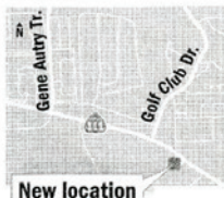
THE DESERT SUN

Cathedral City-based Glory to God Ministries International has purchased the former Osko Night Club on East Palm Canyon Drive in Cathedral City for $2.1 million. Brokerage firm Sperry Van Ness says the buyer plans to convert it into a church with a TV studio.