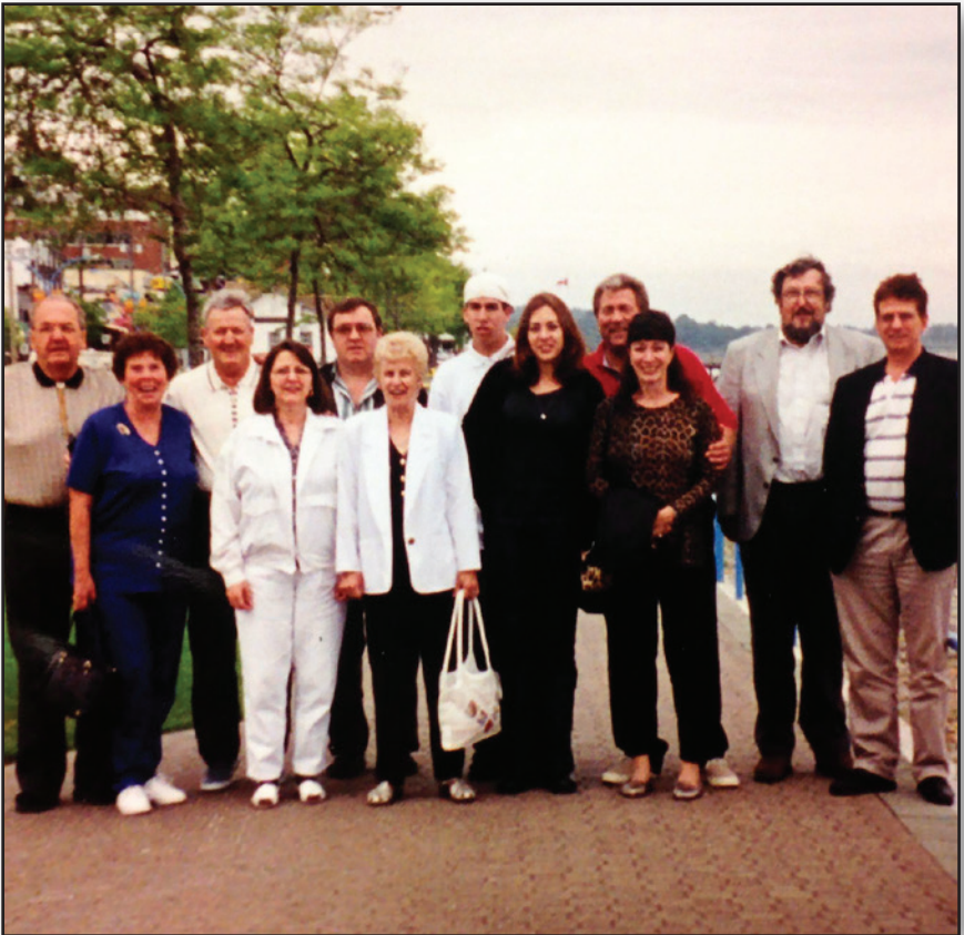
Canadian Glory To God Ministries Board